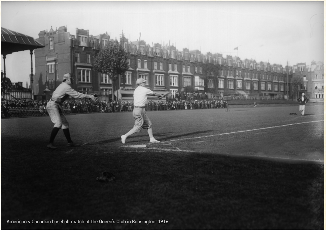
American v Canadian baseball match at the Queen's Club in Kensington; 1916