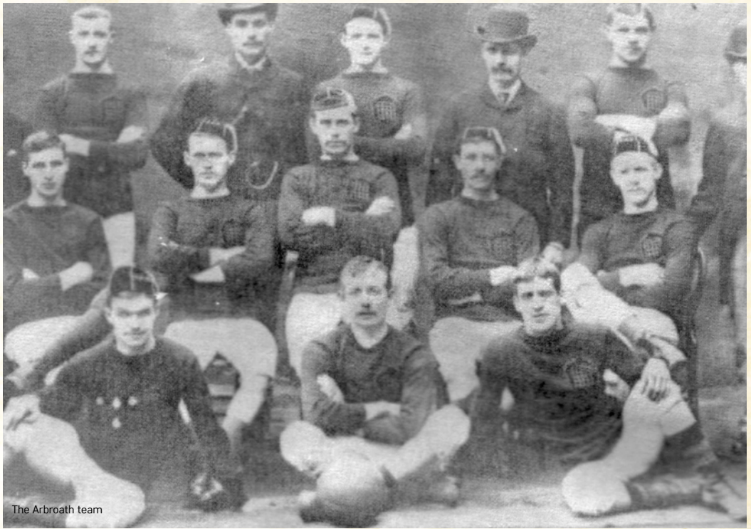
The Arbroath team

Their opponents, Stade Olympique L'Emyrne, took complete control of the national league game, reducing Adema to the role of onlookers, as they deliberately plonked the ball in the back of their own net 149 times, in protest over a refereeing decision.