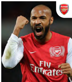
Thierry Henry Arsenal